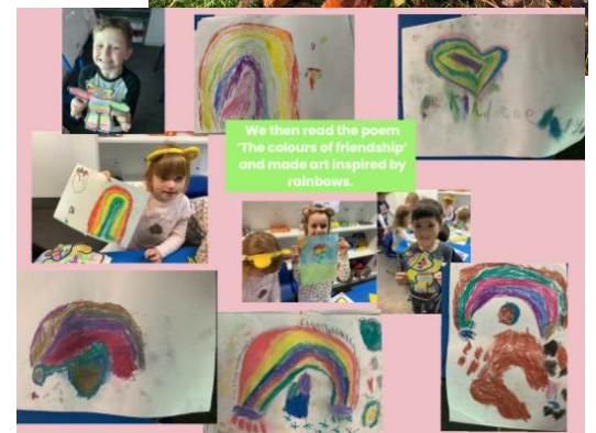
We then read the poem 'The colours of friendship' and made art inspired by rainbows.

Now we have reached the end of the term, I would like to thank all our teachers and staff who have worked exceptionally hard this academic year. It truly is an honour to work at this school. To our children and families, thank you for all your support and dedication to all things Bowling Green. An extra well done to those of you who have been completing work while isolating. I want to wish you all a very merry Christmas and here is to a bright and brilliant 2022.