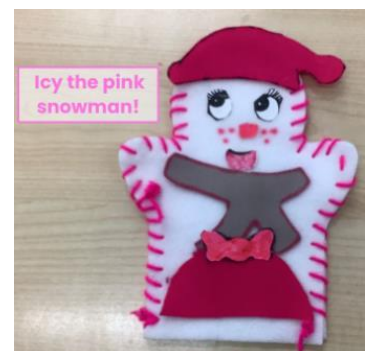
Icy the pink snowman!