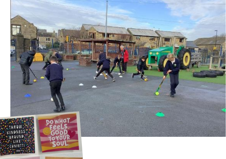
Page 2 of 4